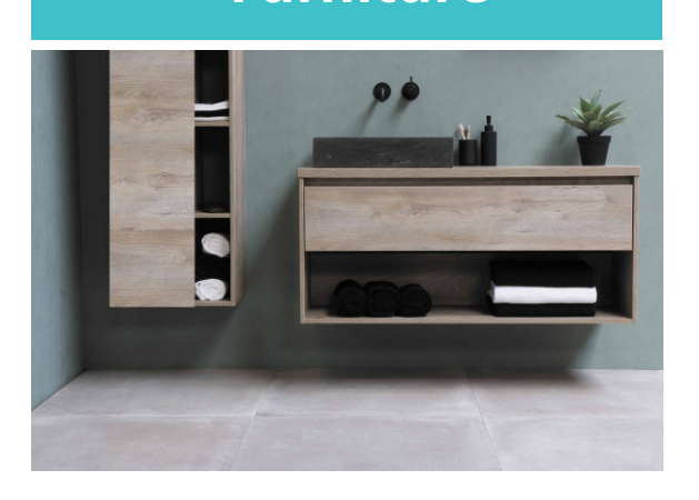
Floor & Wall Tiles